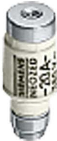
NEOZED FUSE LINK 400V GL, SIZE D01, 2A IN FOLDING BOX