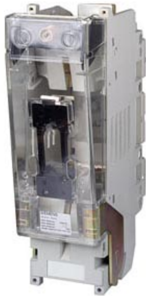
LV HRC FUSE BASE, 690V 1-POLE, 1250A, SIZE 4A