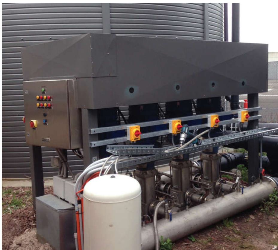
KATKO EMC safety switches installed to a water purification system at the Sydney International Airport.