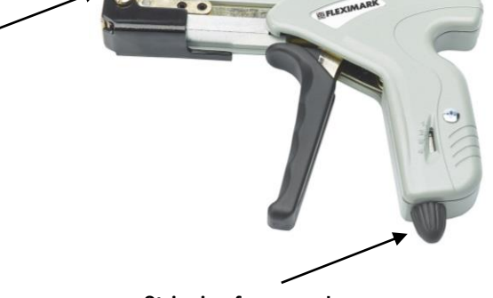
Stripping force can be adjusted in increments.

Cable tie is automatically cut at its end once the required tension is achieved.