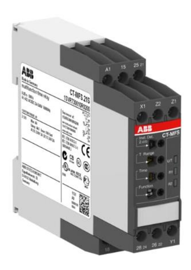
ABB Time relays - CT-MFS.21S