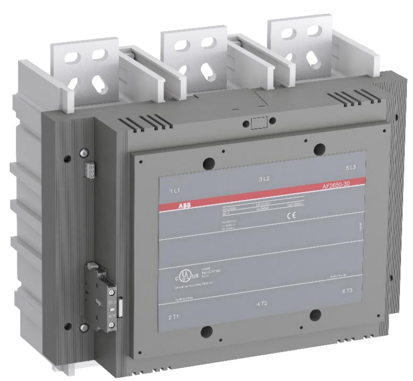
AF1350, AF1650, AF2050, AF2650

Production site: Xinhui, China September 2023