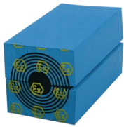
RM Ex module with core