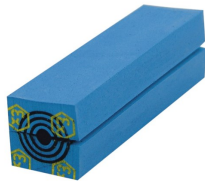
RM Ex module with core