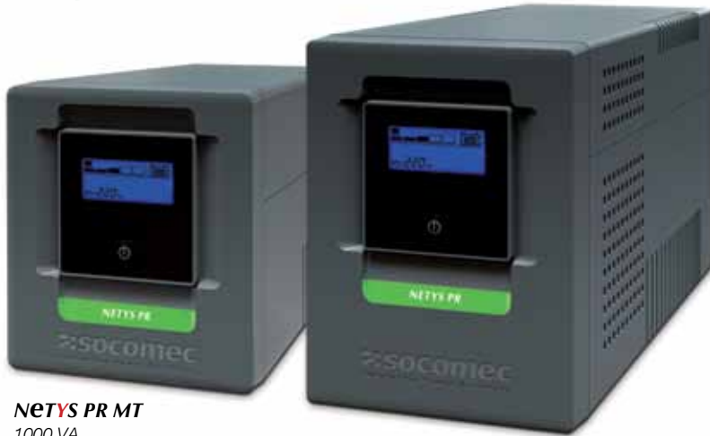
NETYS PR MT 1000 VA