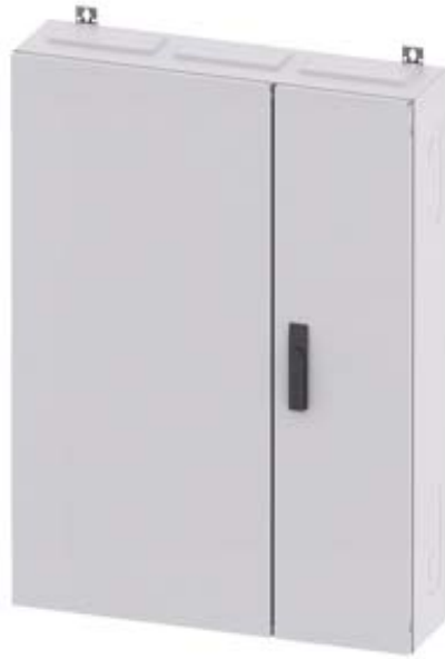
ALPHA 400 DIN, WALL-MOUNTING DISTRIBUTOR, DELIVERY FORM FLAT PACK, AP-CUBICLE, RAL 9016, IP43, SK2, H=1100 W=800 D=210