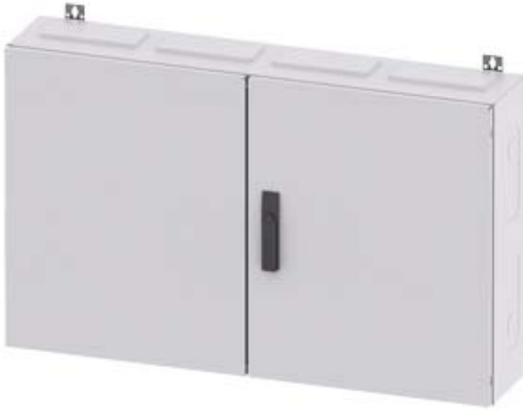
Similar to image

ALPHA 400 DIN, WALL-MOUNTING DISTRIBUTOR, DELIVERY FORM FLAT PACK, AP-CUBICLE, RAL 9016, IP43 SK1, H=650 W=1050 D=210