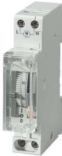
SYNCHRONOUS TIME SWITCH DAY 1 NO 230V/50HZ 1 TE