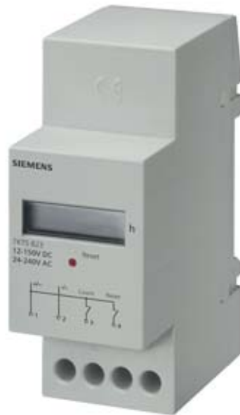
ELECTRONIC TIME COUNTER DC 12-150V, 24-240V, 50HZ ELECTRICAL RESET