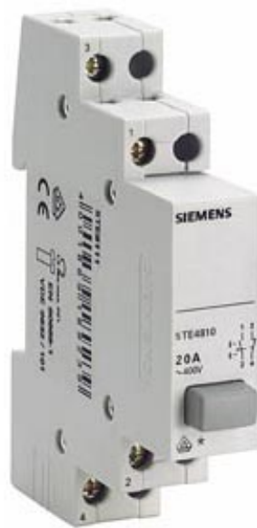
PUSHBUTTON, D=70MM 1NC/1NO 20A, 1BUTTON GREY WITH CAP RED AND GREEN