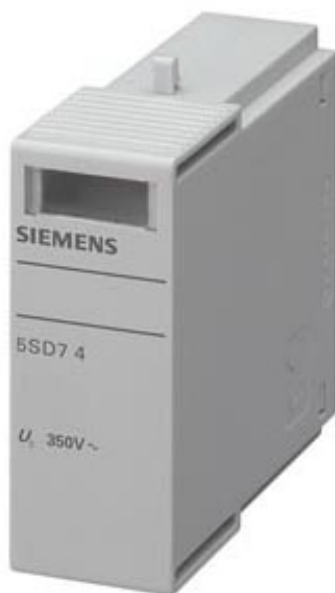
MALE CONNECTOR TYPE 2 L-N REQUIREMENT CATEGORY C, UC 350V 1POLE F. SURGE ARRESTER 5SD746...